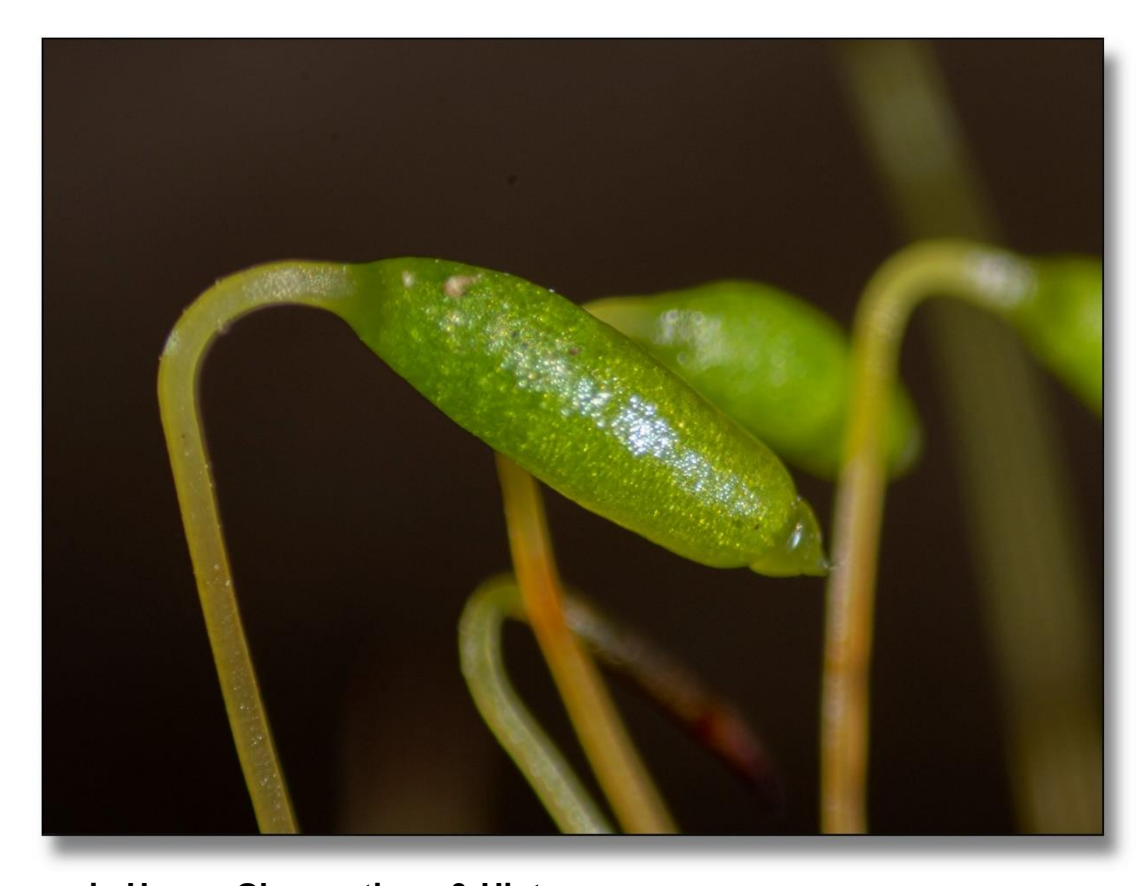
The Lenses in Use.... Observations & Hints

I also find I can get surprisingly sharp images when using the SFX2 in its active mode and focusing on a subject closer than 15cm.