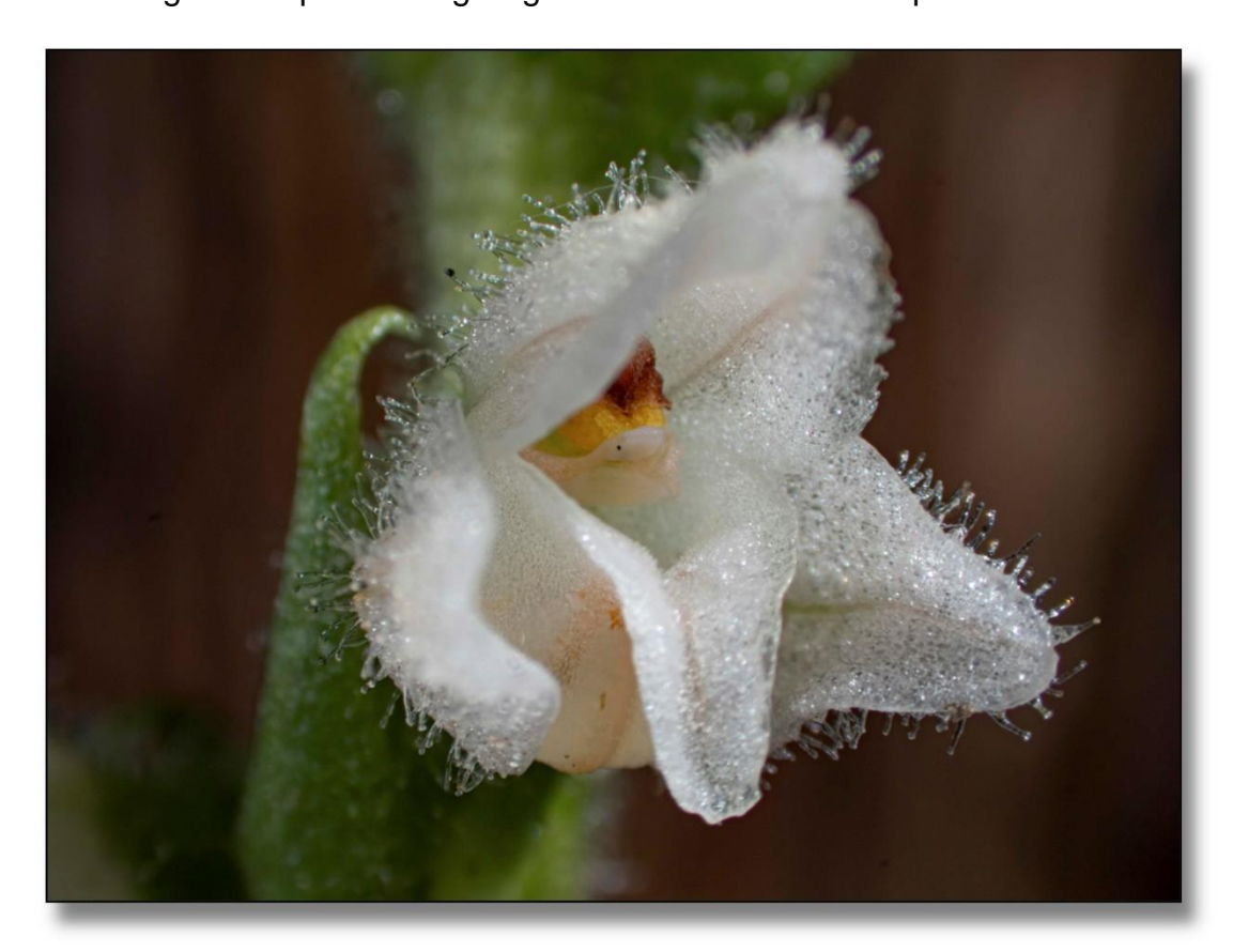
Micro - The lenses from Infinity Photo-Optical Company employ a state-of-the-art microscope lens at the subject end of the tube, not a run-of-the-mill machine lens.

Most "standard" macro lenses allow us to go to life-size (1:1) whether they are 50 mm, 100 mm or longer or, in the realm of the super macro lenses going from around life-size to 4-5x when used on a full frame sensor. Of course, smaller sensors – including Micro 4/3 take a smaller portion of the image circle produced giving rise to the so-called 'crop factor'.